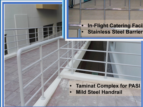
• Taminat Complex for PASI • Mild Steel Handrail