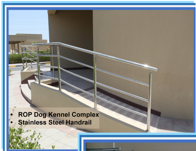
• ROP Dog Kennel Complex • Stainless Steel Handrail