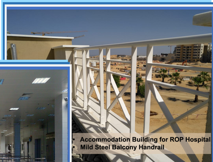
• Accommodation Building for ROP Hospital • Mild Steel Balcony Handrail