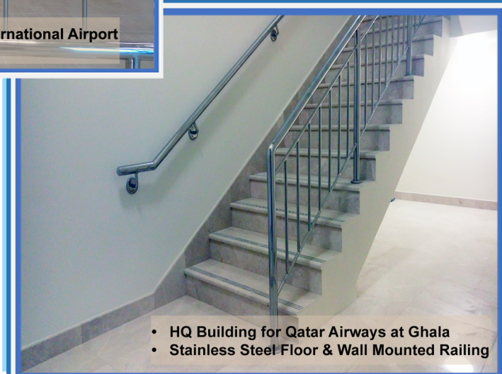
• HQ Building for Qatar Airways at Ghala • Stainless Steel Floor & Wall Mounted Railing