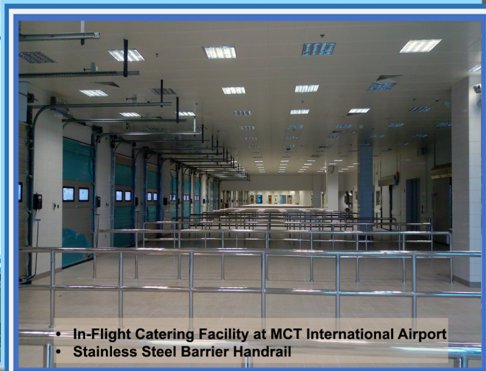
• In-Flight Catering Facility at MCT International Airport • Stainless Steel Barrier Handrail