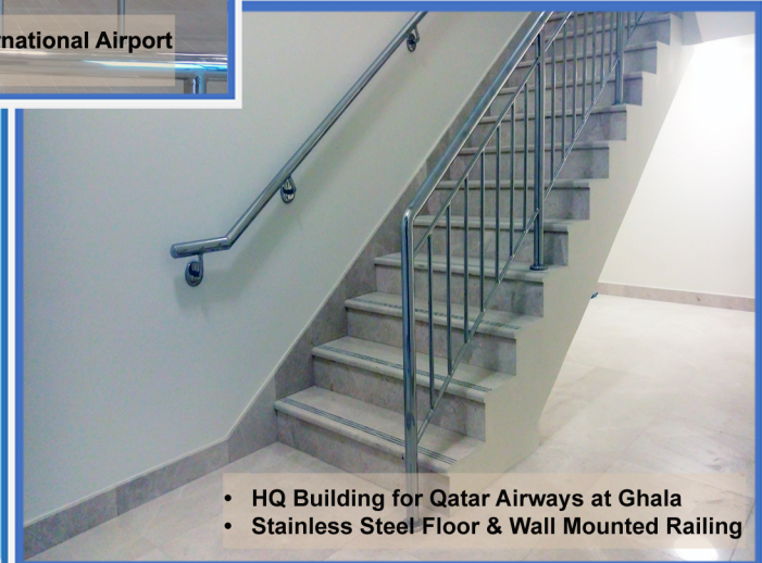
• HQ Building for Qatar Airways at Ghala • Stainless Steel Floor & Wall Mounted Railing